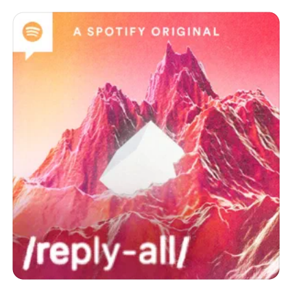
Reply All Gimlet