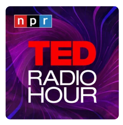
TED Radio Hour NPR