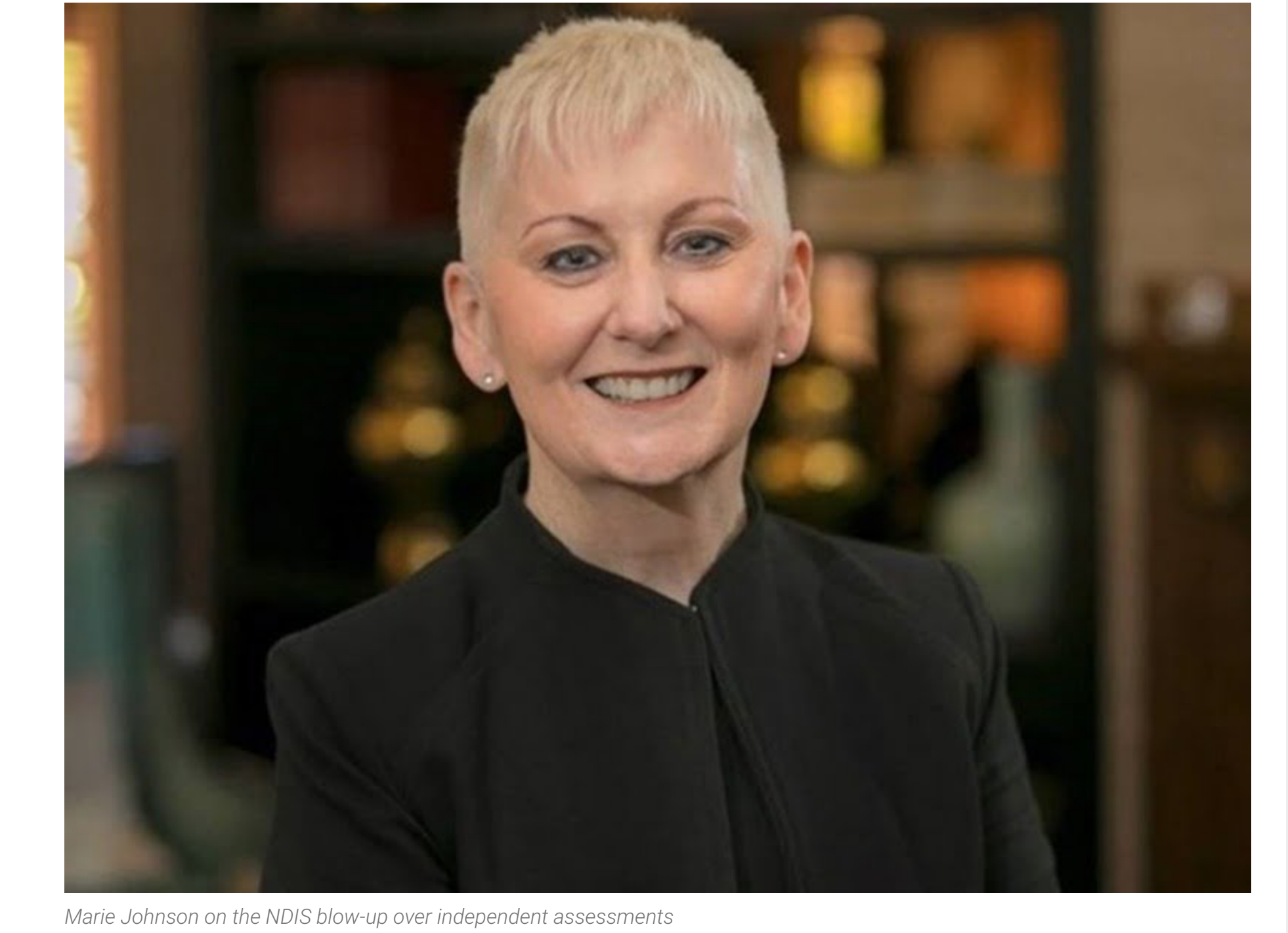
What exploded was not a fight about 'reform'.

When combined, the impact of algorithms and King Henry VIII powers on Australian citizens is unfathomable. These two forces are eating away at our democracy.